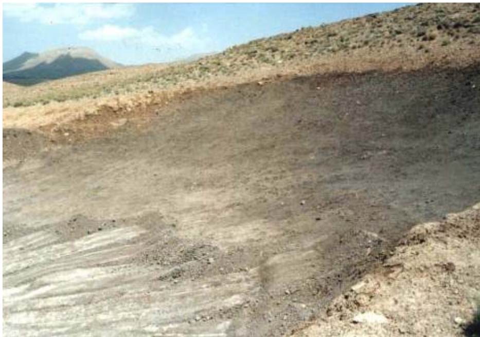
Fig 10 -Nasrabad black sand mine.