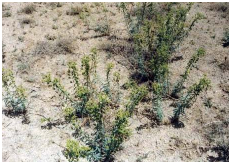
Fig 11- Ephedra Strobilacea is used in manure pit.