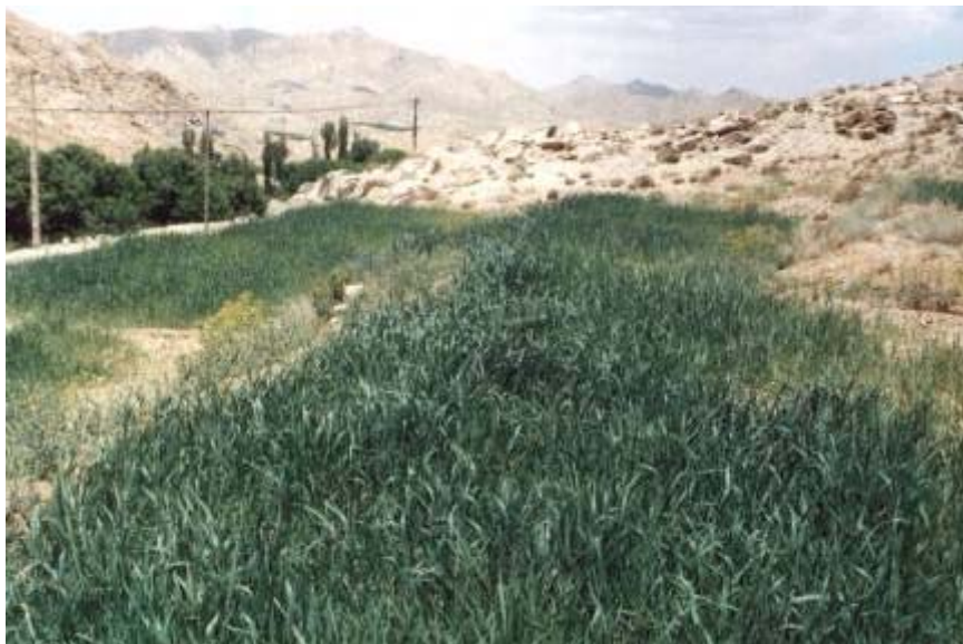
Fig 1: less irrigation with terrace building for wheat growing (Sanij)