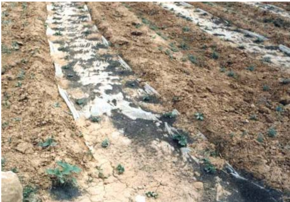
Fig 6: less irrigation using plastic mulches (Hemmatabad).