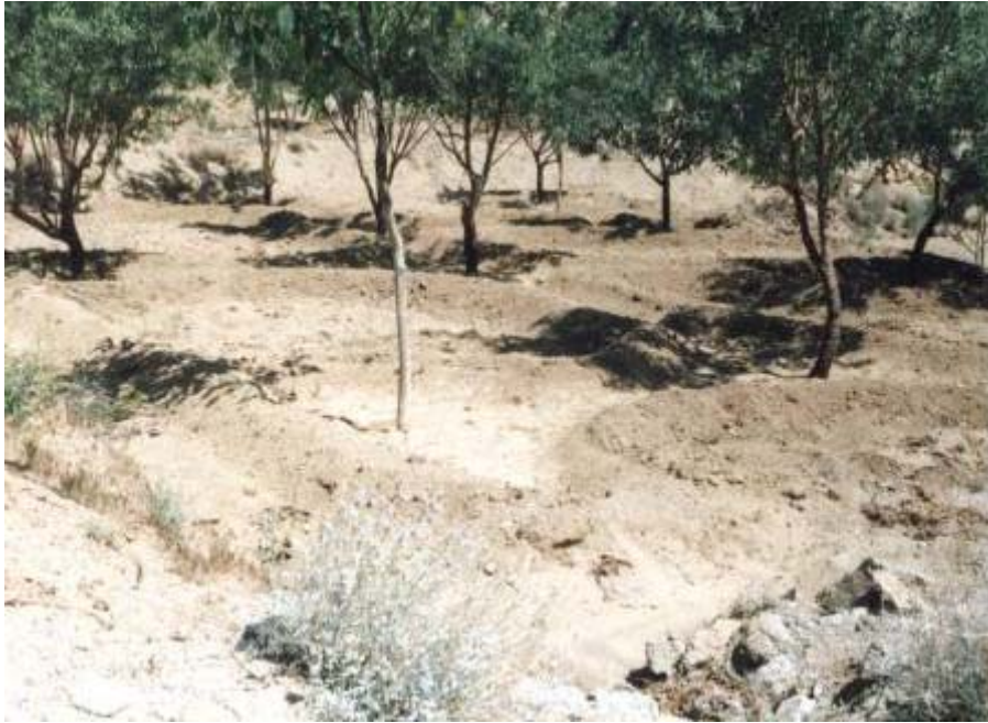
Fig 3: less irrigation with making sinks around the trees.