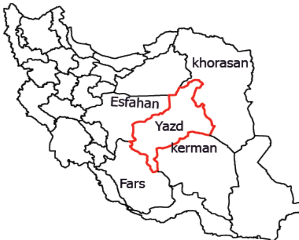
Fig 1- Situation of Yazd province in Iran

In this study historical resources around water and irrigation water used .In addition , field study has been done anal , query forms was filled by qualified farmers and experts .Analysis of data and information fulfilled by SPSS software.