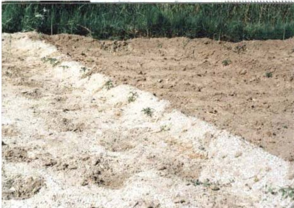
Fig 4: less irrigation using sandy mulches (Aliabad).