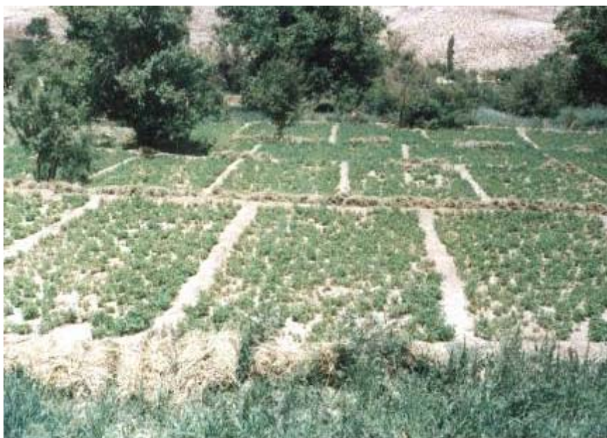
Fig 2: less irrigation with partitioning (little partitions 3*4 m 2 ) (Sanij)