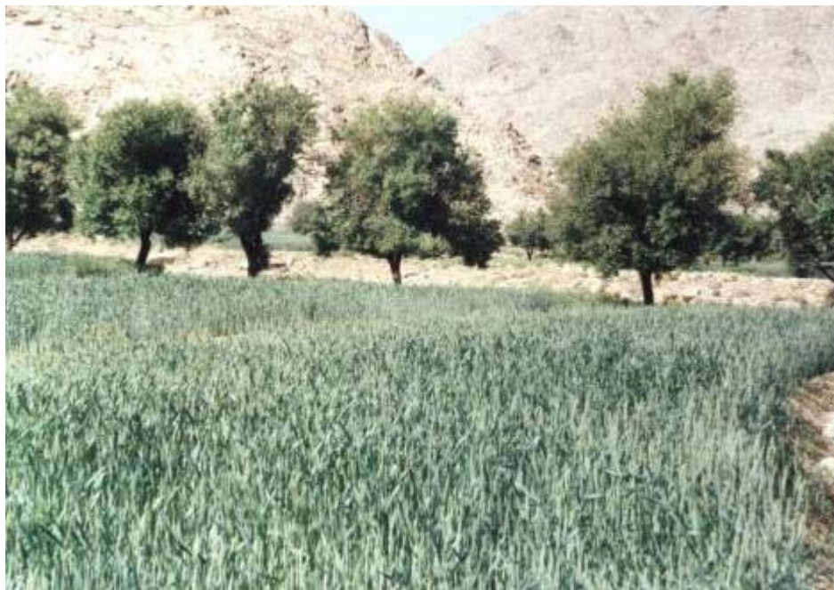
Fig 8- Discipliner plantation to adopt with drought.