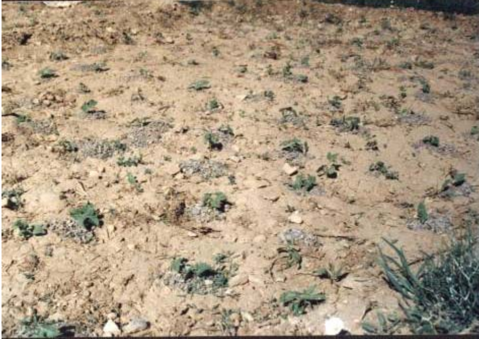
Fig 5: less irrigation using black sandy mulches (Aliabad).