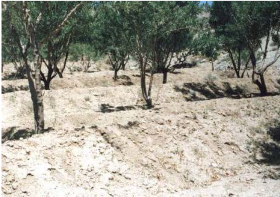
Fig 7- Little Irrigation with building mound between the trees (Nir).