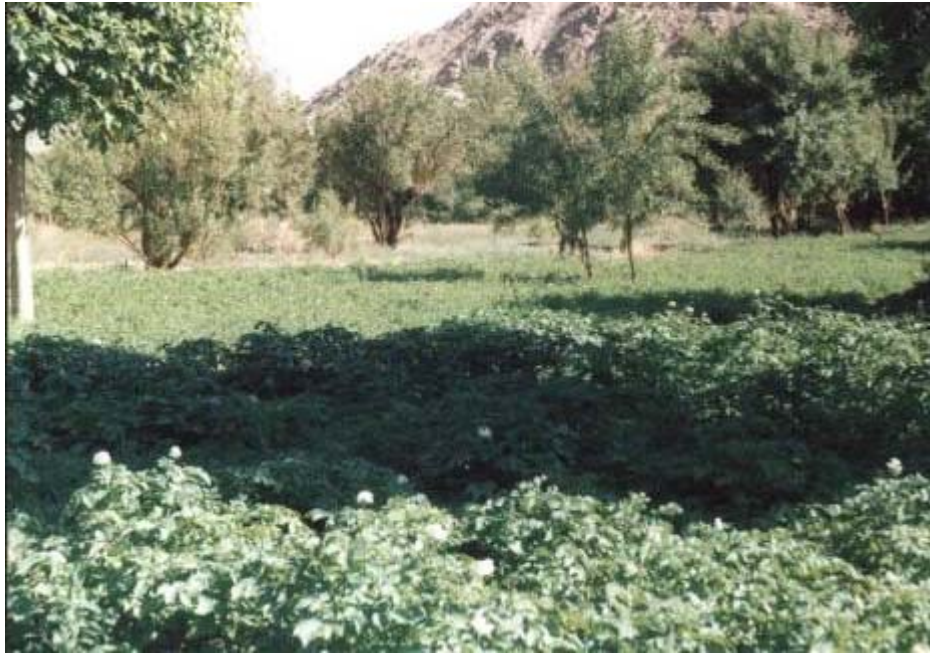
Fig 9 -Discipliner plantation to adopt with drought, potatoes and beans within almonds garden (Sanij).