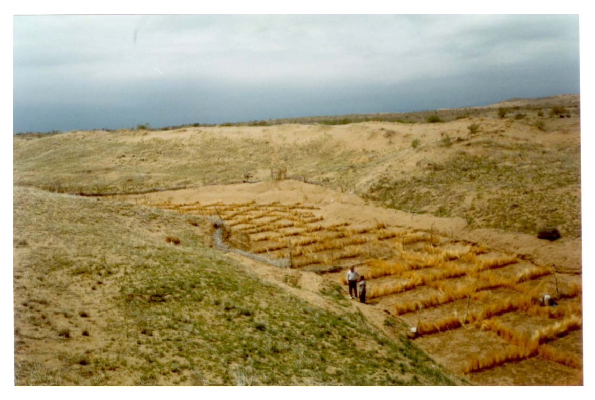
Figure 8: The cultivation in a pit in Band rig