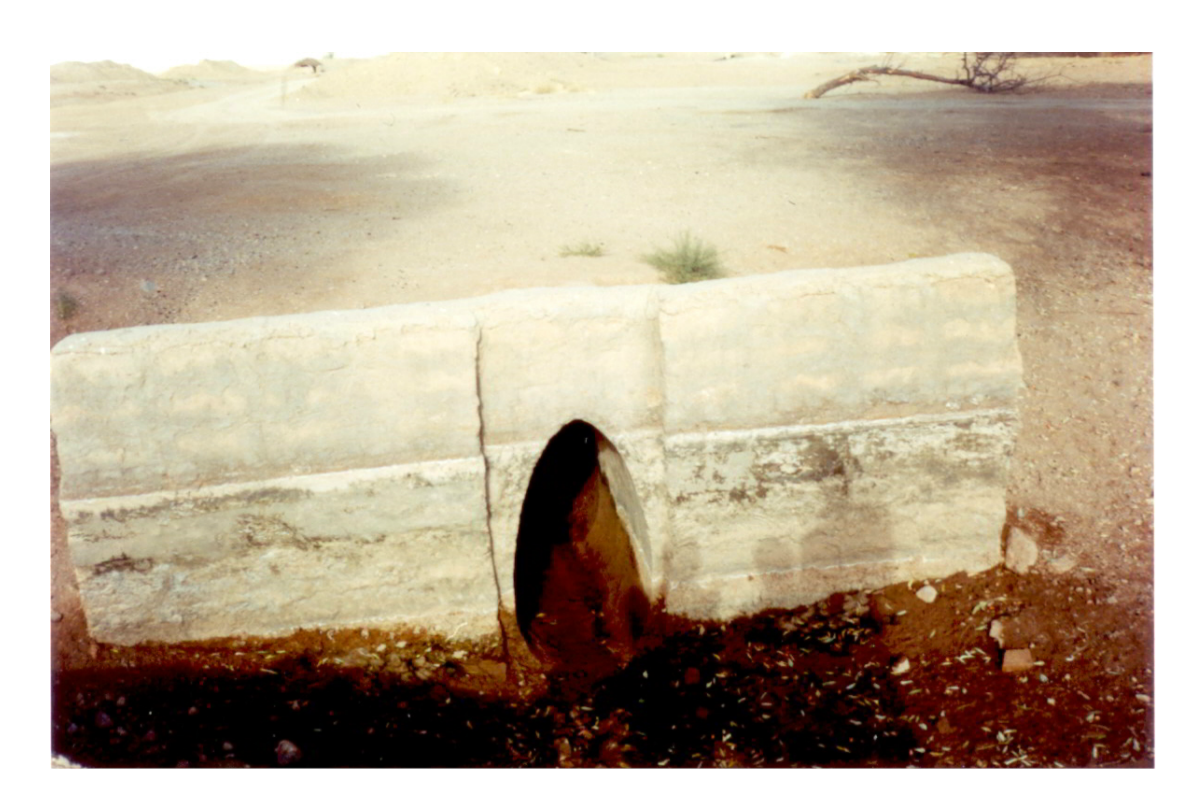
Figure1: Subterranean canal appearance