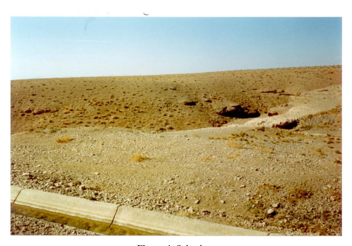
Figure 4: Sohe dam