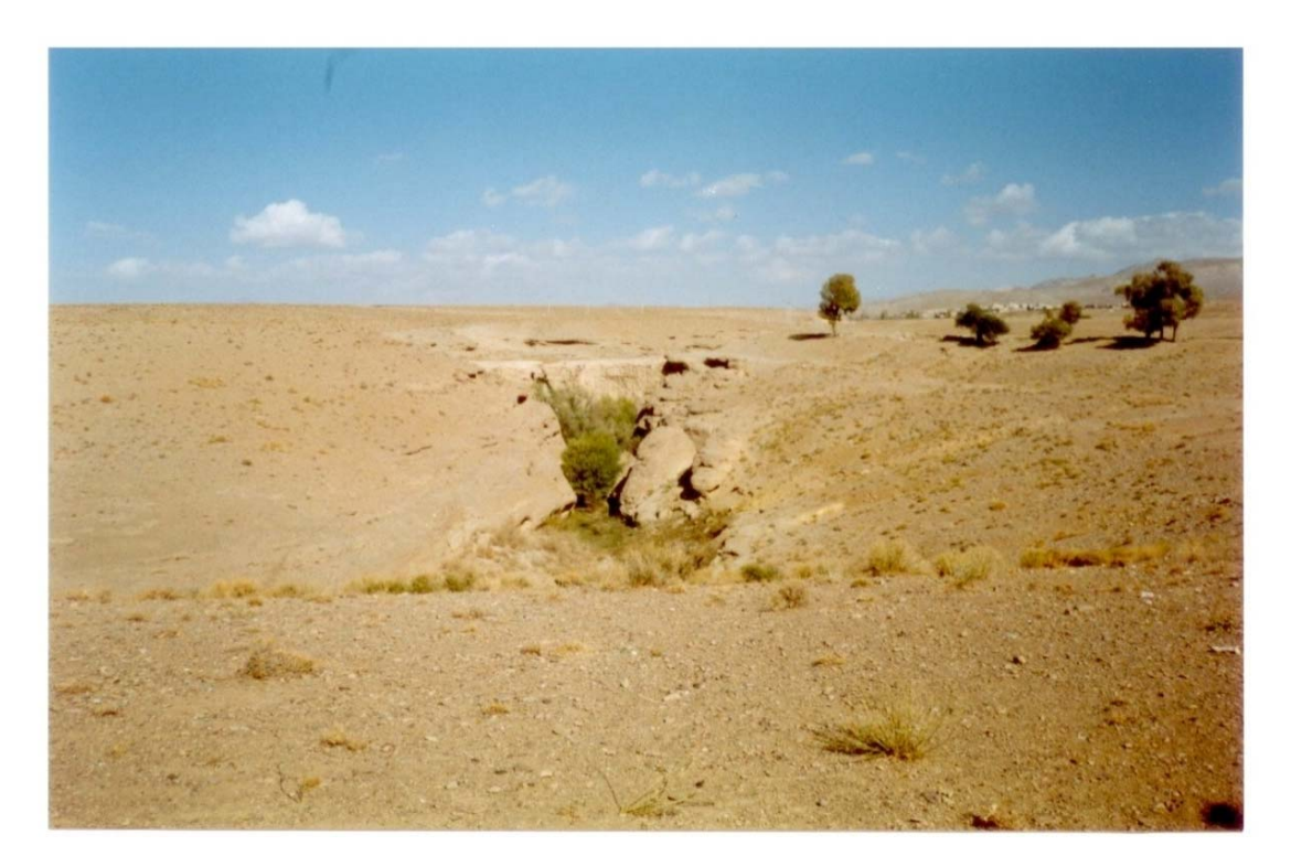
Figure 5: Sohe dam