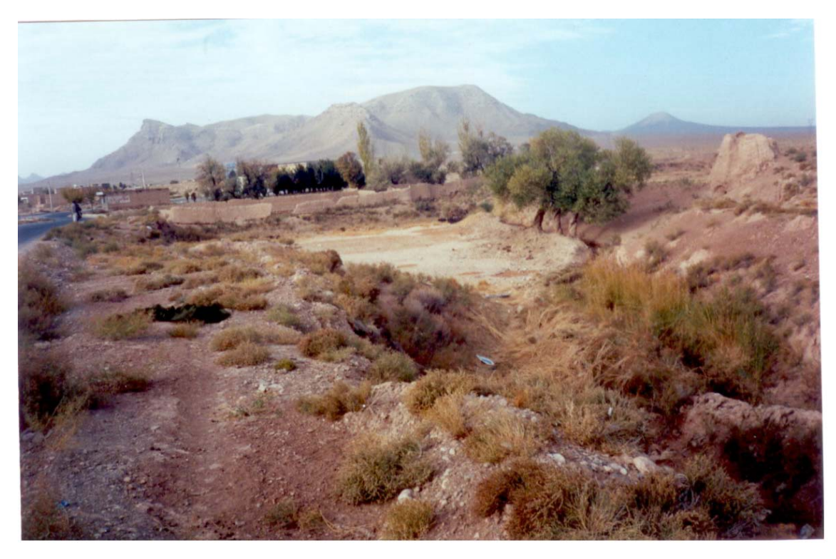
Figure 2: Azan pool