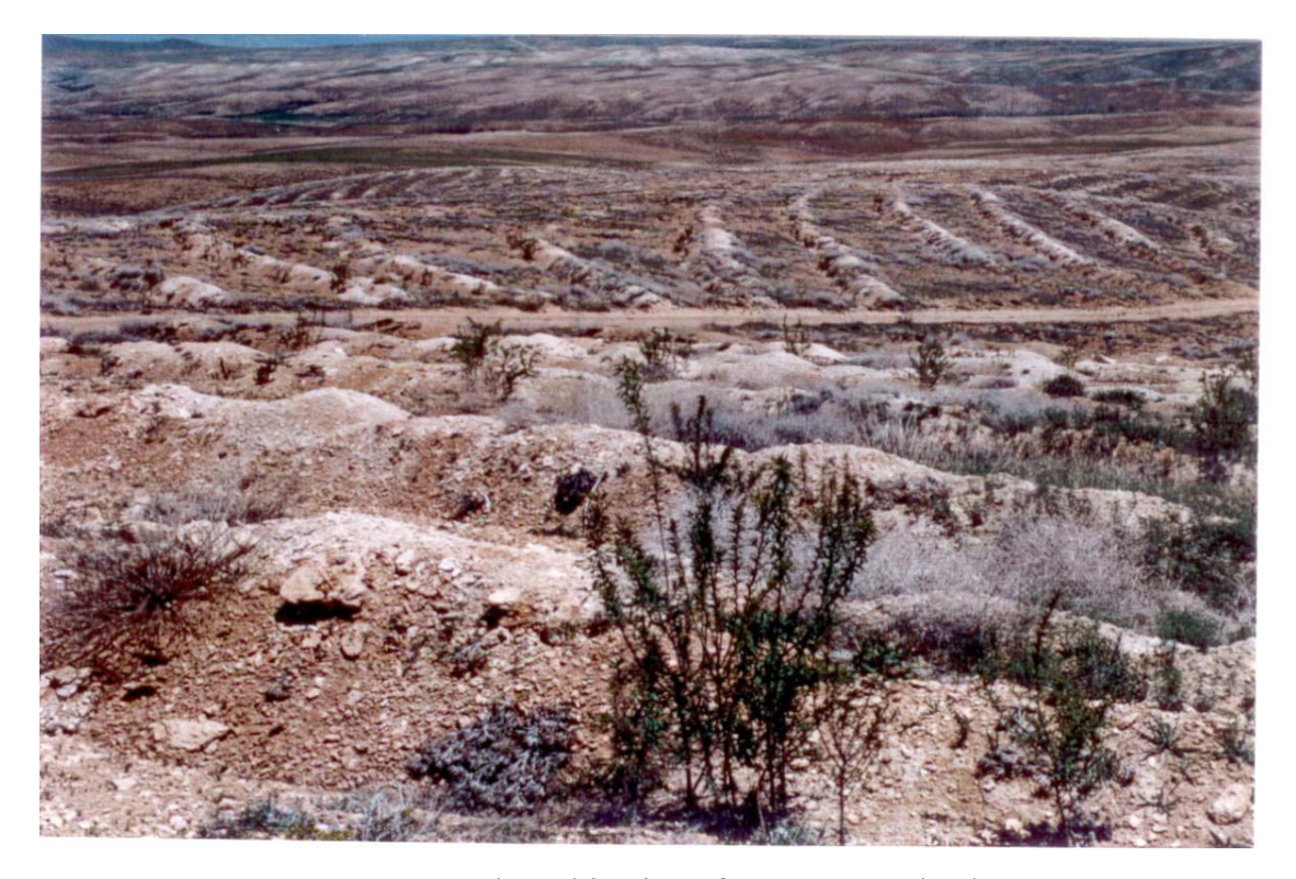
Figure 6: The cultivation of trees on step lands