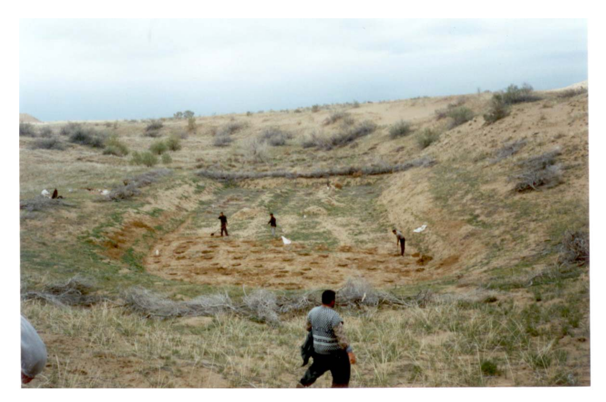
Figure 9: The cultivation in a pit in Band rig