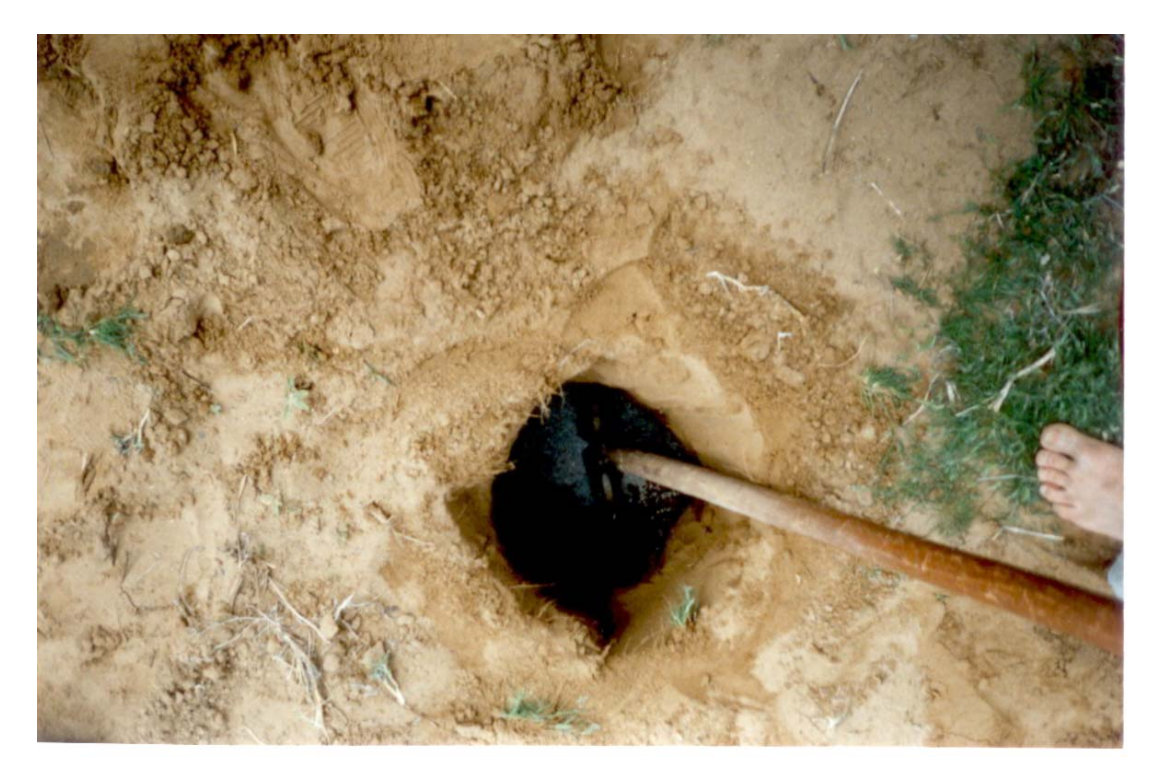
Figure 10: Digged pit for cultivation in a pit