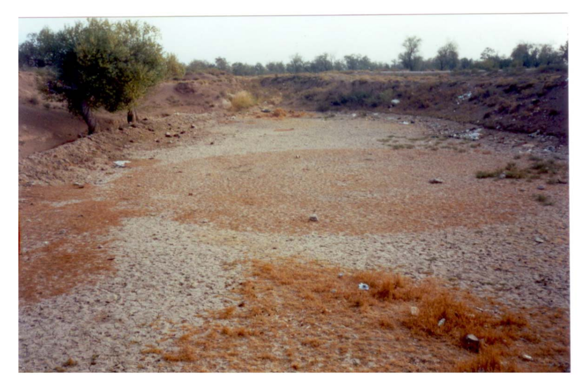
Figure 3: Azan pool