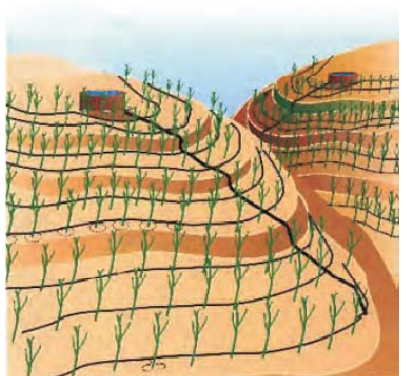
Zero Energy Micro Irrigation System on undulating land.