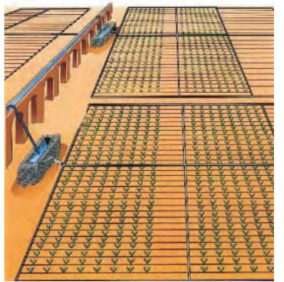
Zero Energy Micro Irrigation System on flat land