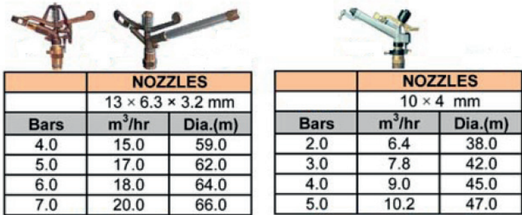
Fig. 2. Typical sprinkler nozzles used for moving sprinkler irrigation system

The area under the first 60% of the sprinkler’s radius is generally sufficiently irrigated to grow vegetation without the need for an overlapping sprinkler. Beyond this 60% line, the amount of water diminishes with distance. The maximum spacing recommended, therefore, is such that its 60% of radius line meets the 60% line of its neighbor. The 40% remaining distance is irrigated by both the neighbouring sprinklers and gets adequate water then. In cases where the soil is very coarse, wind speed is high, humidity is low or temperature is high, closer spacing is recommended. Head-to-head, or 50% sprinkler spacing, is the most common spacing used in moving sprinkler irrigation. Where winds are a threat to good coverage, spacing as close as 40% may be required.